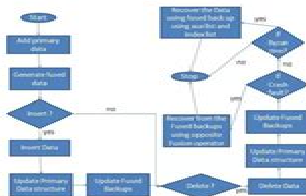
Fig 1: architecture of system