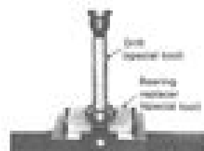
Separating the sprocket from the bearing

Special tool Bearing rollers ST1123 0000 Sprocket rollers ST1124 0001