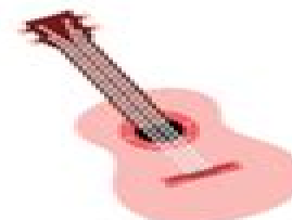
play an instrument