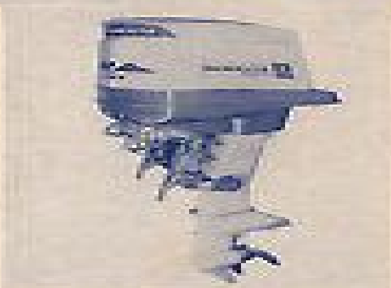
Homelite 20-hp Grand Prix