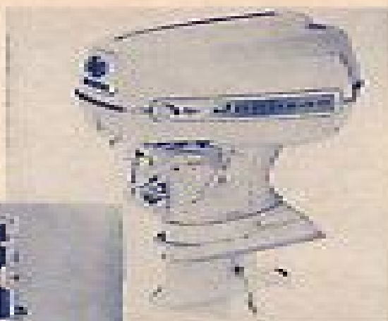
Johnson's 20-hp Golden Motor