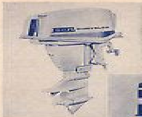
The 20-hp Chrysler 20