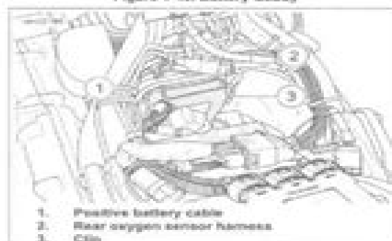
Figure 1-50. Battery Caddy Wire Routing