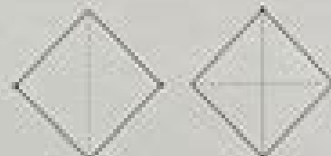
2.2.3a Straight lines from center 2.2.3b Curved lines from center

The following chapter will divide the paper into radial segments, and the results will be quite different from those shown here.