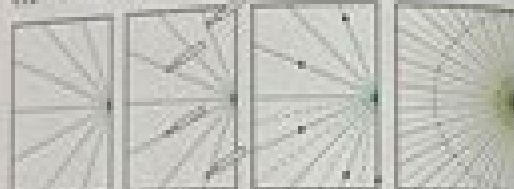
2.2.2a Straight lines from center 2.2.2b Curved lines from center 2.2.2c Straight lines from edge 2.2.2d Curved lines from edge