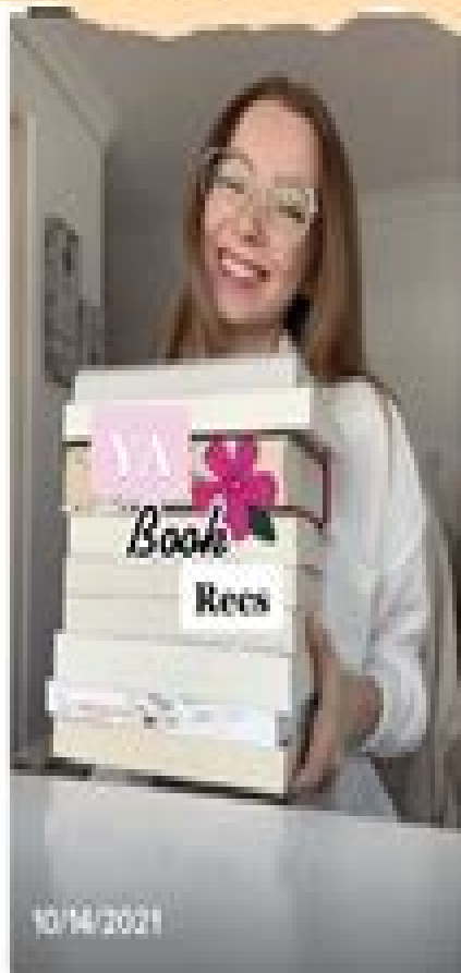
10/14/2021 ...#yabooks #yabooktok