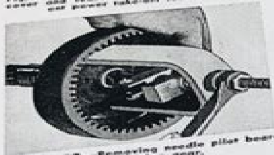
Fig. IH457C—Removing needle roller bearing from ring gear.