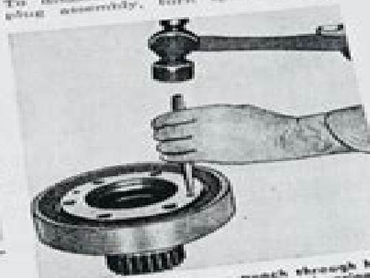
Fig. IH458A—Using a punch through holes of sun gear to remove rear bearing.

Withdraw the planet carrier and pin shaft from housing and mark the rear face of each planet gear so it can be found in each planet position. Using installed as shown in Fig. IH458A, use a punch on Eusa roll pins which retain the planet gear shafts in the planet carrier and remove the shafts. Remove spacers and needle bearings. Remove spacers (26)—Fig. IH457 or 457A, from housing (26)—Fig. IH457 or 457A, and nut gear and from housing (26) from (26) from housing (26) is damaged, then. If rear bearing (33) is damaged, use a punch through holes in both and use the bearing from the rear gear shaft. To disassemble the spring retainer plug assembly, turn spring anchor