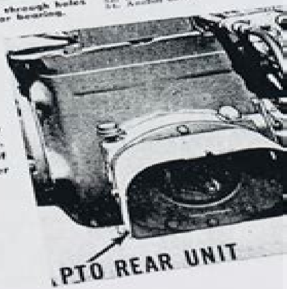
Fig. IH458B—Rear view of the tractor rear frame, showing the installation of the independent power take-off rear unit.