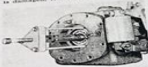
Fig. IH457B—Using OTC puller to remove cover and rear drum from the independent power take-off rear unit.

rear bearing (33), remove snap ring (34) and using a punch through the rear holes in the ring gear teeth, remove bearing from shaft. Inspect needle roller pin bearing (33). If the bearing is damaged, it can be repaired, using