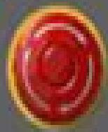
TABLE Series 0: Main