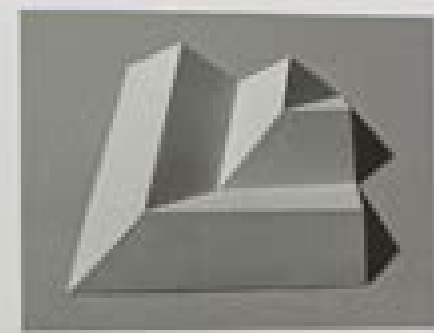
Example Set 2 The square rotated 45 degrees will create diagonal lines of equal length, and an angle of 90°. The transformation made for a given object that is required paper are made directly, and if the object is composed of two (two pages: 4.4 + 4.5).